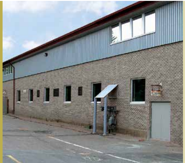
Halifax, Nova Scotia

Fixative is a silicate dilution and our most versatile product allowing for several different applications. Fixative is almost completely transparent and allows for the natural background variation of the surface to show through. It can be used to pre-treat surfaces, to fill absorbent pores and to solidify older lime or cement plasters. Fixative is recommended as a primer to all mineral paint applications.