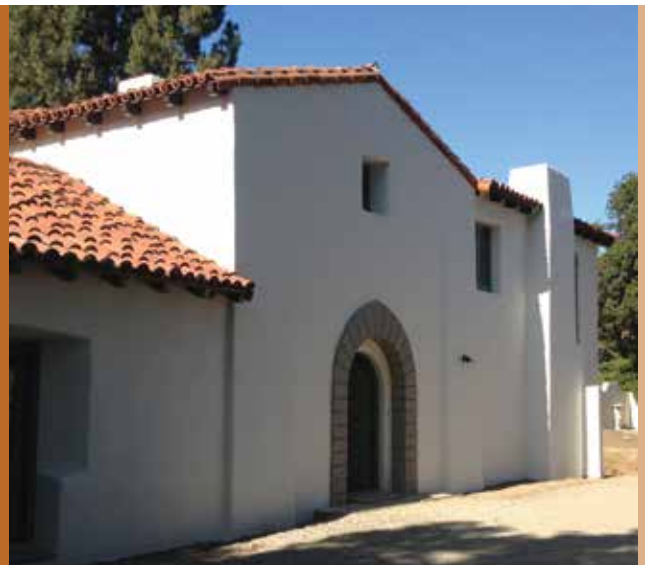
San Marino, California

Quartzguard is a vapour permeable and water repellent paint designed to provide the same type of coverage as a traditional latex paint. Quartzguard has excellent hiding capabilities with a matt finish. Quartzguard is a superior product for exterior painting of any masonry including brick, stone, stucco, concrete and plaster.